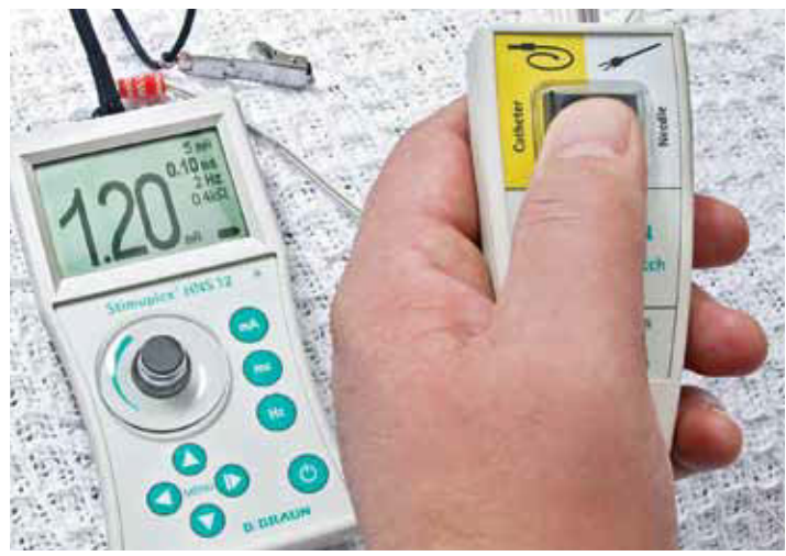
Change stimulation current from needle to catheter with the simple flick of a switch