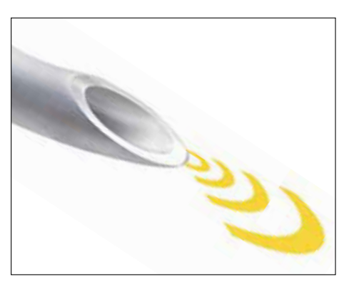
Microdot Electrode tip on needle focuses current more precisely for optimal motor response