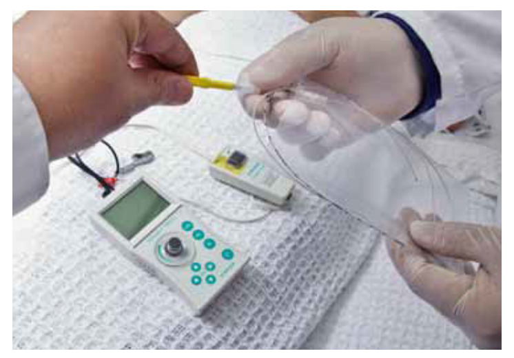
Plug needle and catheter into switch box before procedure