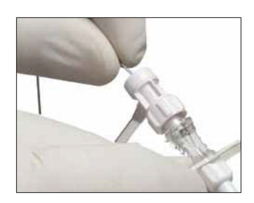
Stylet reinforces catheter for added stiffness and easier threading