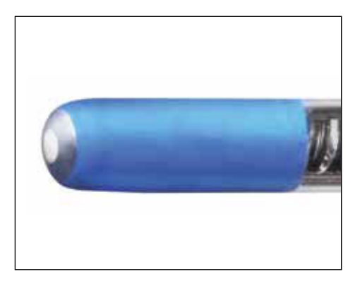
Fully enclosed, flexible tip helps reduce trauma and enhances glide through needle